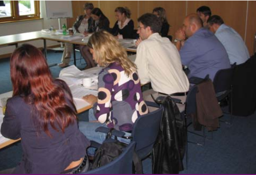
Bulgarian officials meeting at GO-East

T welve officials from the 'Management of EU Funds Directorate' in the Bulgarian Ministry of Finance paid a visit to GO-East on 23 August. The aim of the visit was to learn how the European Structural Fund Objective 2 Programme is