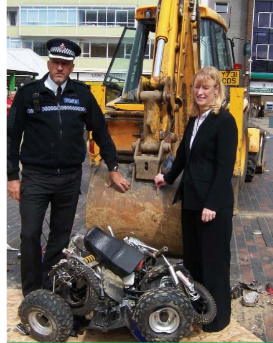
Joan Ryan MP launching a crackdown on the misuse of mini-motos

The nuisance caused by illegal use of mini-motos is of growing concern across the country. Reckless drivers of mini-motos who disrupt and damage communities can now receive points on their licence, face a driving ban, a fine or even have their vehicles crushed under the new guidance from the Respect Task Force.