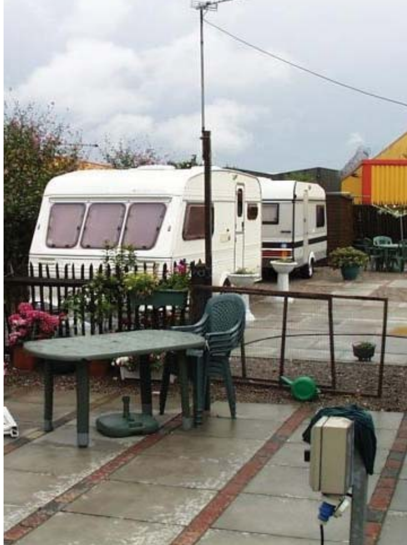
Travellers have struggled to find appropriate sites

The loss of some official sites has led to parts of the community camping illegally on private and public land. There has been a great deal of negative media coverage and conflicts have arisen with local communities. To add to this, traditional Traveller employment is on the decline – there are few opportunities for blacksmiths, farm labourers or crop harvesters, and as a result more Travellers are migrating towards cities where there is a lack of suitable accommodation.