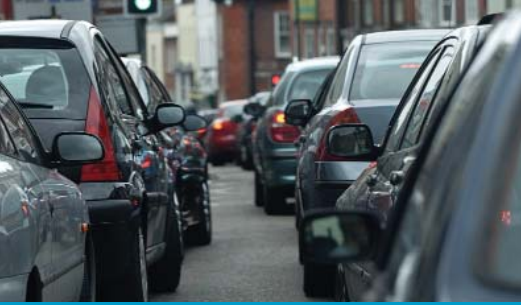
Transport schemes will aim to reduce congestion

This new funding will ensure that the region benefits from 25 planned local transport improvement schemes, including a major scheme for Ipswich town centre, helping to ease congestion and improve public transport.