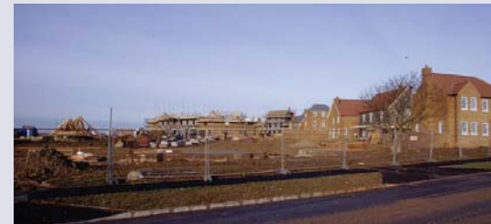
Building homes in the region